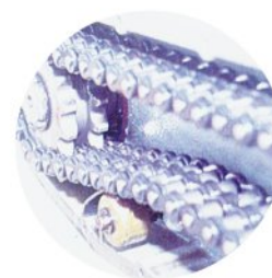
Partial photograph of ratary tillage chain